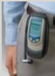
Flip Display enables right-side-up viewing whether the gage is in your hand, on your belt or on a work table