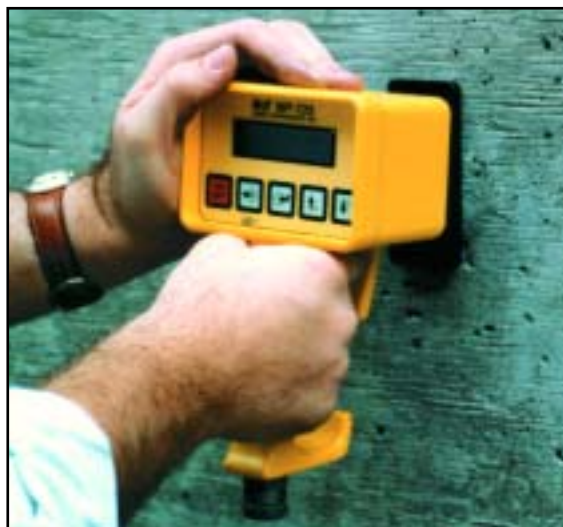
Front and Side View