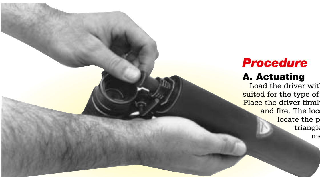
Manual Depth Gauge