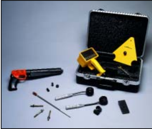
The Windsor HP Probe System.