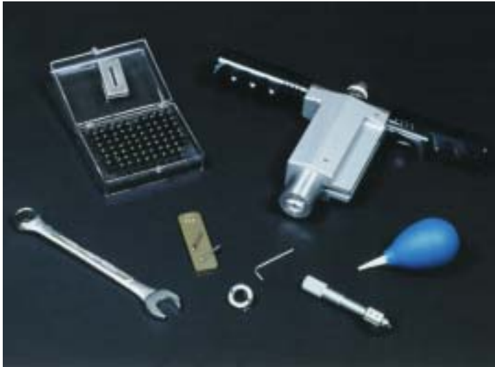
Windsor Pin System